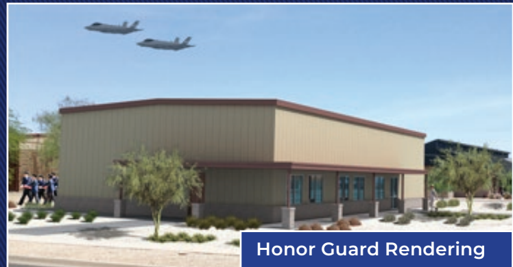
Honor Guard Rendering